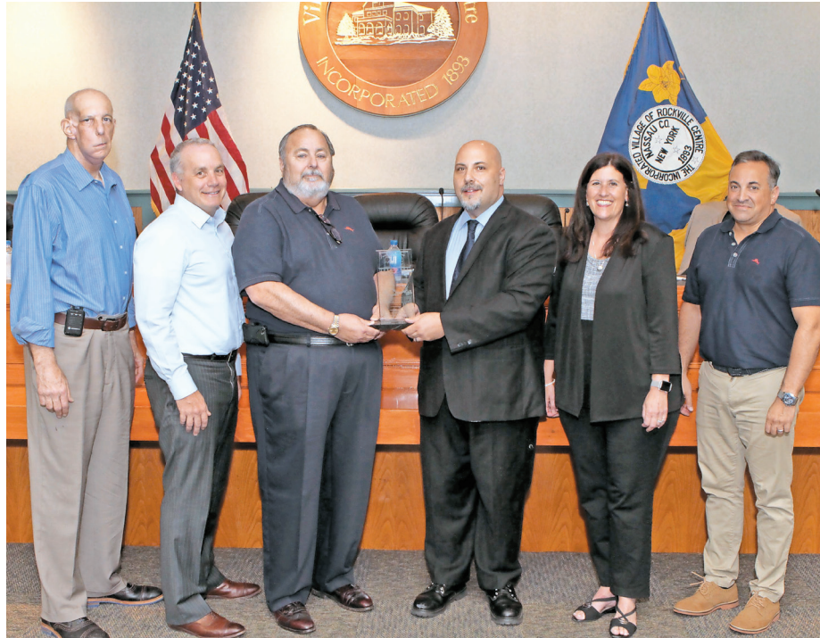
The Village of Rockville Centre received the "Sense of Place" award on June 8th at the 2018 Smart Growth awards ceremony from Vision Long

Island. Celebrating 20 years of working to lay the ground work for architectural modernization in Nassau and Suffolk counties, Vision Long Island has promoted more livable, economically sustainable and environmentally responsible growth throughout Long Island through Smart Growth. The award recognized the Village's thriving downtown.